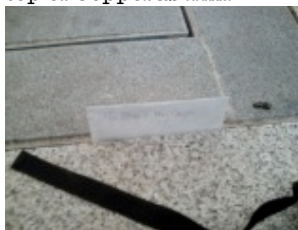
Marble block bench surrounding tree, outside Topshop, Church St.