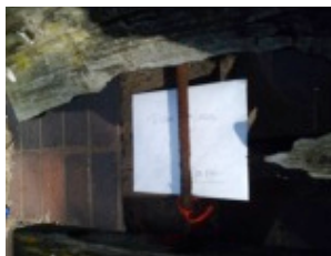
Burnt out & rotting bench near Sea Circle sculpture, top of Copperas Hill.