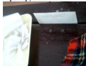
Prom bench at New Brighton