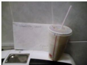
Burger King toilets, Church St