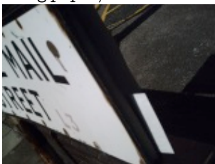
Royal Mail St L3

The first letter was left at Liverpool Lime St station, the metal benches near the Virgin offices and cafe nero. There is no photo of this one.