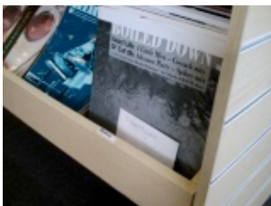
Oxfam dance records