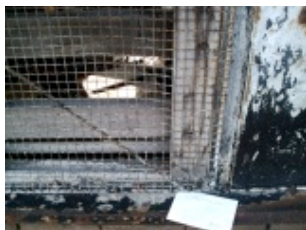
Disused building on Brownlow Hill